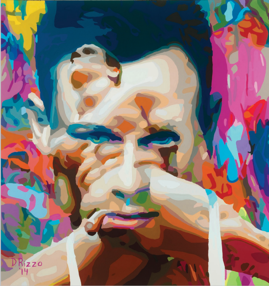
VITAMIN-D DEFICIENCY. Acrylic on Canvas, 36" x 38"